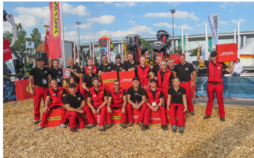
His trade fair team at INTERFORST 2018 in München, Germany.